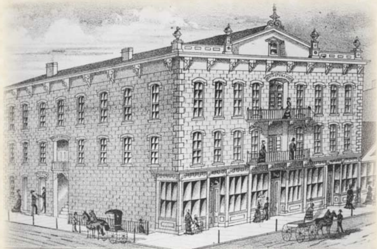
BENT'S OPERA HOUSE, MEDINA, TOWN OF RIDGEWAY, ORLEANS CO. NY

The Orleans Renaissance Group, Inc. is proud to undertake the Bent's Opera House Restoration Project in the Downtown Historic District of Medina, NY! In 2008, ORG acquired this architectural jewel—a 19 th century bustling center for the arts—and since then, has been busily developing a phased restoration plan.