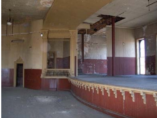
The stage at Bent's Opera House as it appears today.

provide the Group with the necessary information to determine the scope and cost of the project. Until that time, the first and second floors will be leased to an appropriate commercial enterprise.