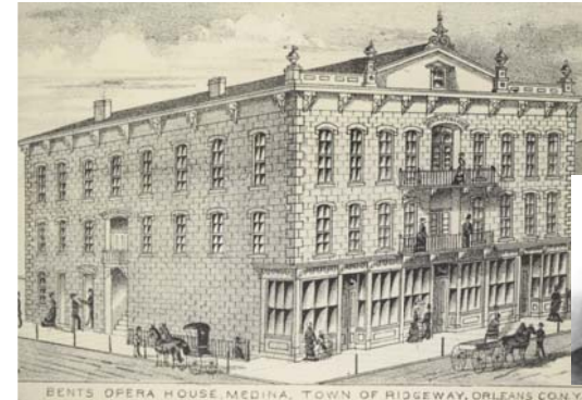
Bent's Opera House, circa 1865, built during Lincoln's Presidency.