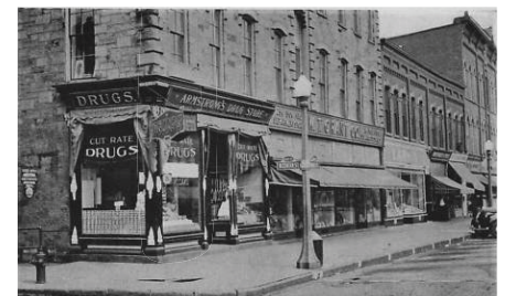
First floor façade of Bent's Opera House, early 1900's.

Its Medina Sandstone construction shares a heritage with such other notable places as Buckingham