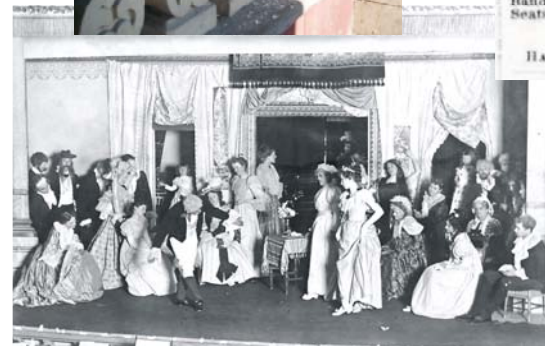
Turn-of-the-century stage production.